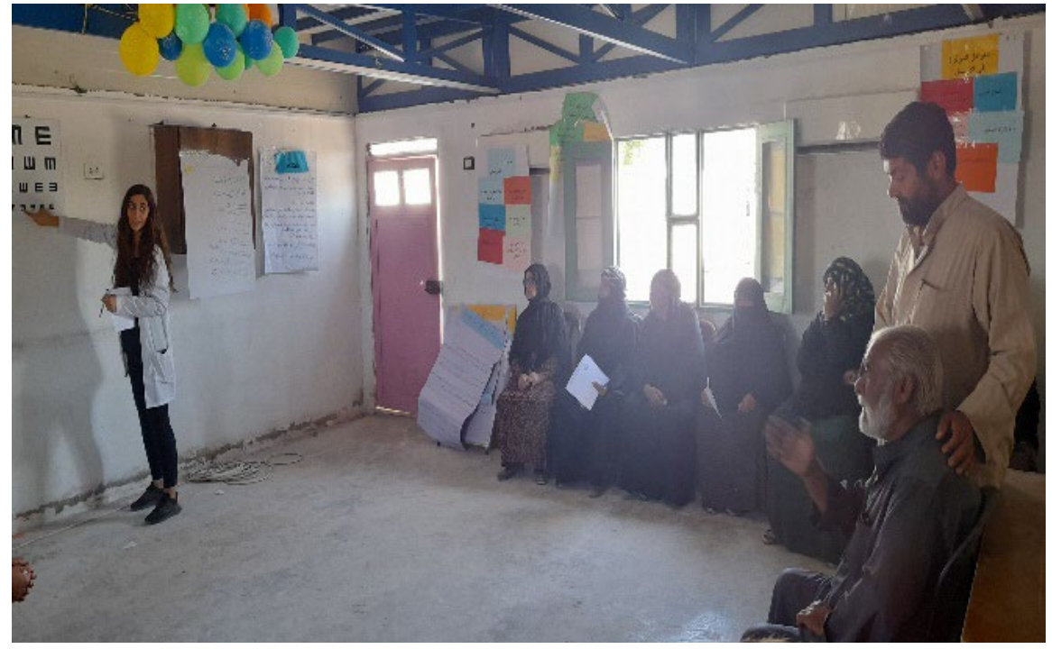
4. Health education on several topics including leishmaniasis, cholera, and breast cancer.

3.A health screening was carried out targeting a group of elderly males and females in the Arisha camp to measure their visual ability and learn about hyperopia, its causes and treatment methods.