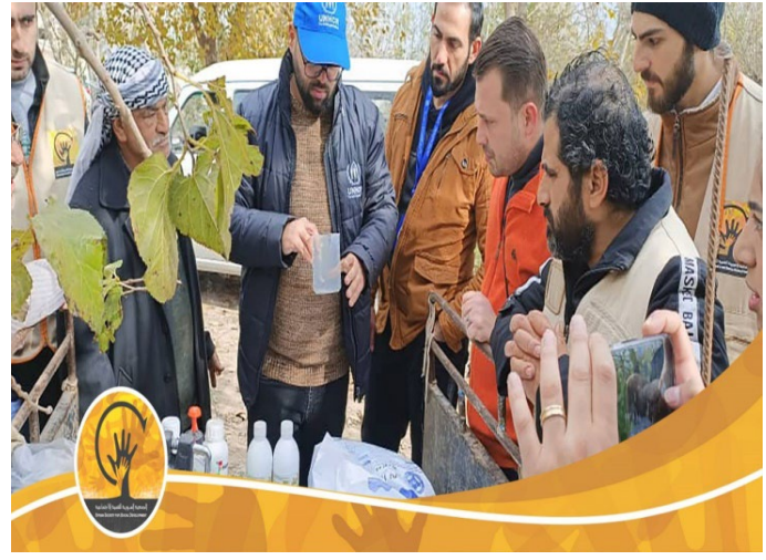
Aleppo – Agricultural Distributions