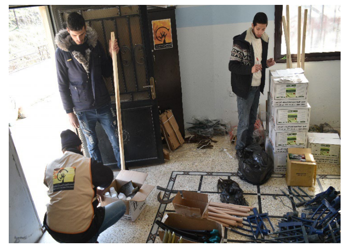
Tartus – Agricultural Distributions